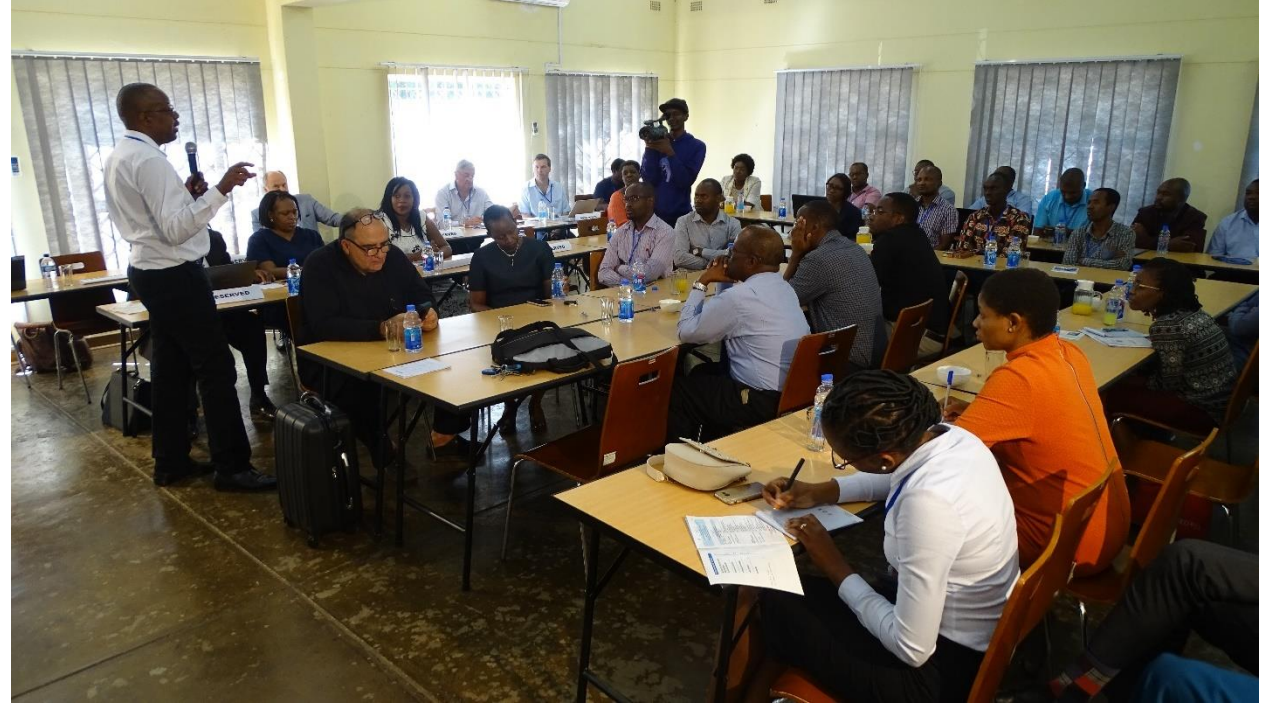
Figures 2: Participants during one of the lectures

• Returning participants regionally were 3 and new participants were 5. Locally returning participants were 12 and 11 new participants.